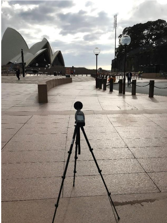
Figure 3 Attended Construction Noise Measurement Location – Position 2